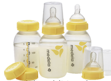
Medela Additional Pump Bottle Sets