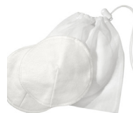
(4 pk) Nursing Pads