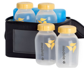
Medela Milk Cooler Set Includes 1 - cooler bag, 1 - contoured ice pack, 4 - 5oz bottles with lids