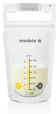
Medela Breast Milk Storage bags 300/case