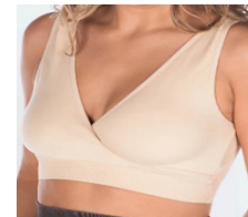
(2) Crossover Nursing bra