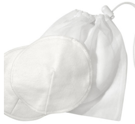
Washable Nursing Pads 4 pads and laundry bag