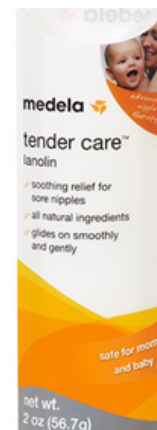
TenderCare Lanolin Nipple Cream