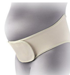
(1) Maternity Support