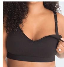
(2) Everyday Nursing Bra